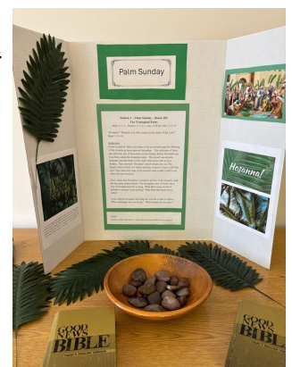
A Good Friday Station