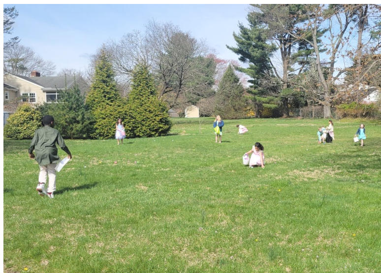
The Easter Egg Hunt was enjoyed by the children on Easter Sunday.