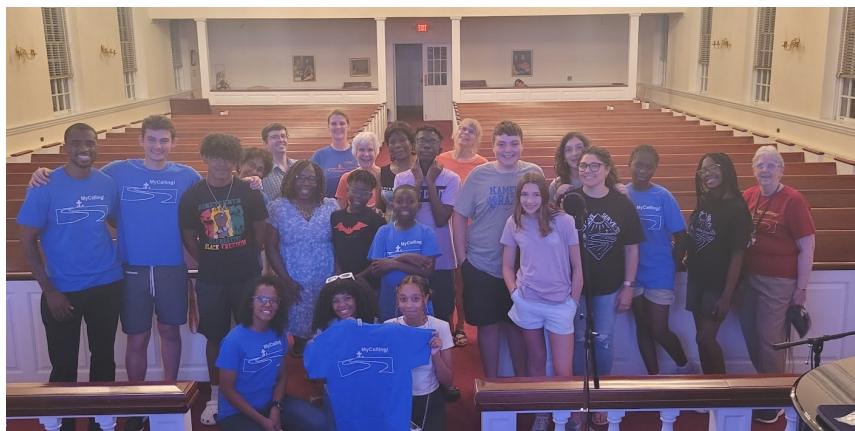
My Calling! Missioners gather to praise God in our Sanctuary

Join us for a meaningful worship service!