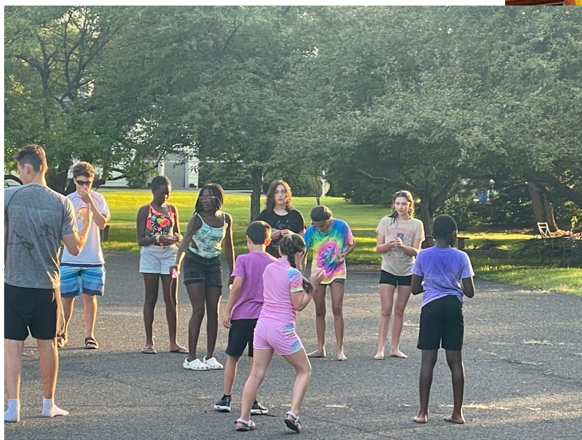
"Water night" for God Squad and Youth