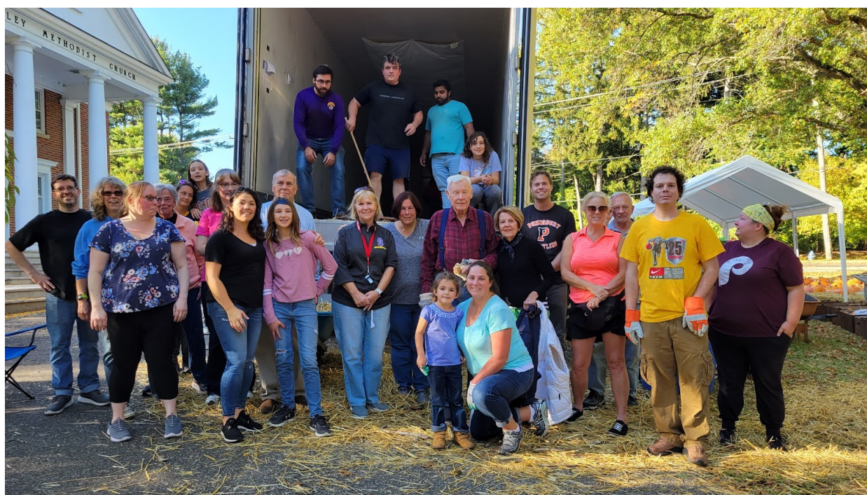
Last year's pumpkin unloading

FRIENDSGIVING is Wed, Nov 15 Bring something to share for dinner!