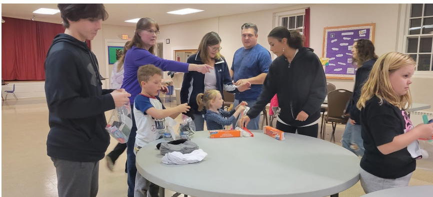
Youth and God Squad mission work

We are also looking for amazing people to open their homes and feed us! You can sign up to be an appetizer house, main dish or dessert house! If you are interested in hosting this group, follow the sign up link or talk to Denise!