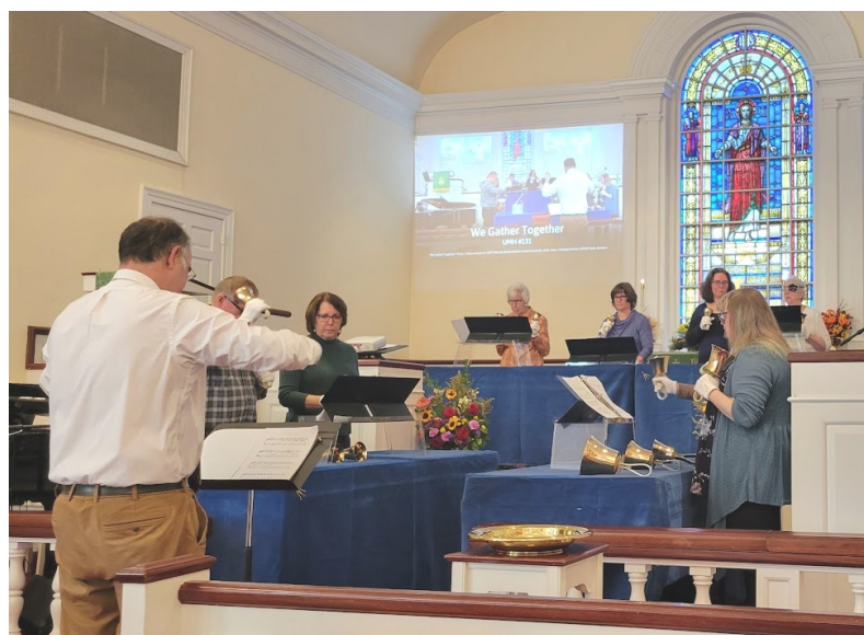
The Bell Choir plays in worship under the direction of our new Music Director.

You're Invited: On Sunday, December 10 at 3 pm, join the 90-voice Bucks County Women's Chorus in the YUMC sanctuary for an afternoon of holiday choral music. The program will include well-known sacred melodies as well as popular secular tunes of the Christmas season. Admission to the 90-minute concert is free; a free-will offering will benefit The Christmas Gala, a local non-profit organization that caters to the needs of low-income seniors in Bucks County and beyond.