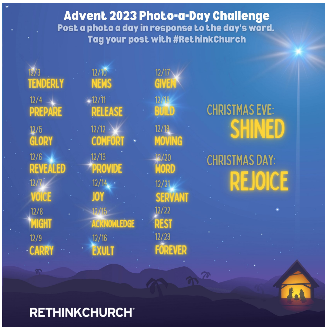
Photo a day

During advent, Rethink church is bringing back their photo a day. Each day has a word attached to it.