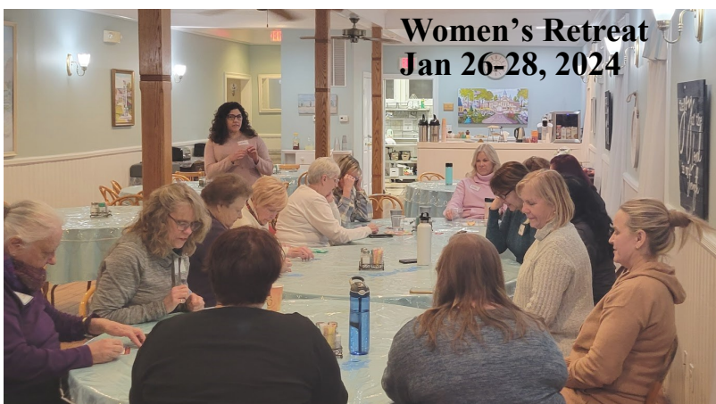
Women's Retreat Jan 26-28, 2024