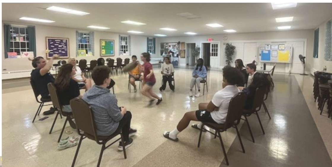
Scenes from Wednesday nights!