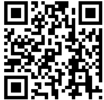
YUMC Youth Events Page

Need to sign up for an event? You can go to the youth website at www.yardleyumcyouth.org and click on events, or use the QR code.