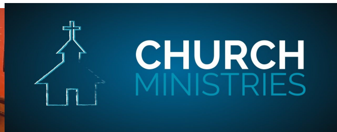
Pub Theology meets once per month. All are welcome!